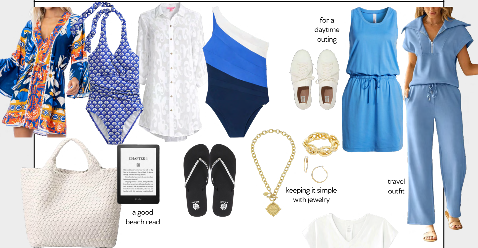
for a daytime outing