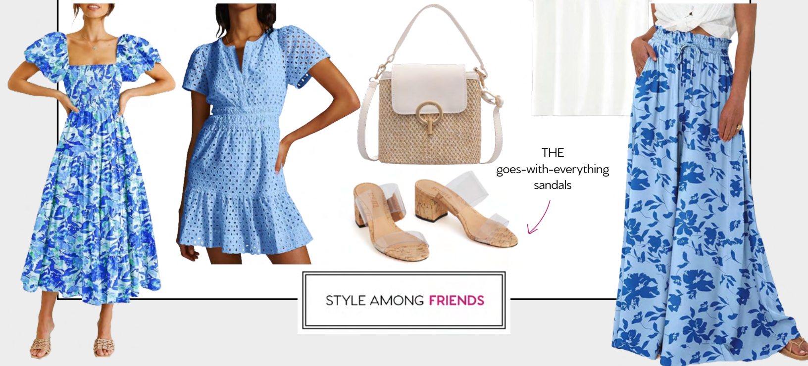
THE goes-with-everything sandals