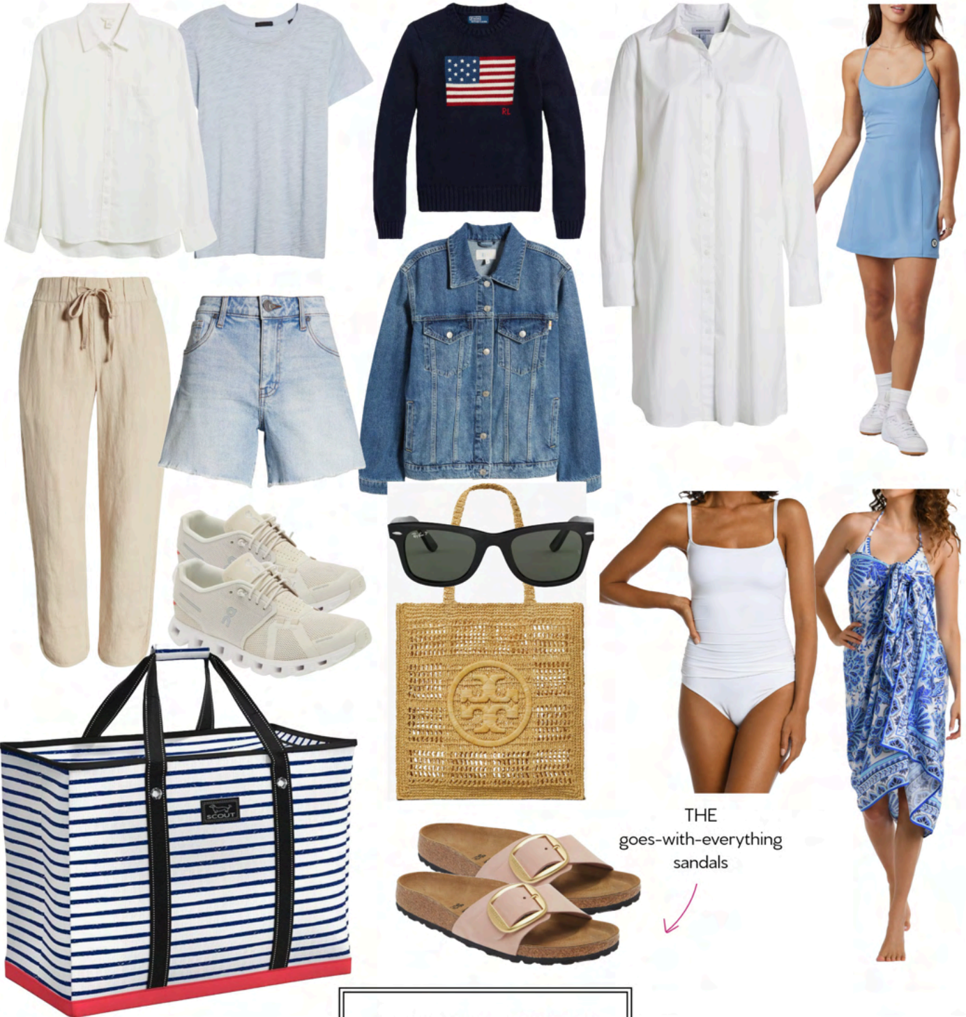
THE goes-with-everything sandals